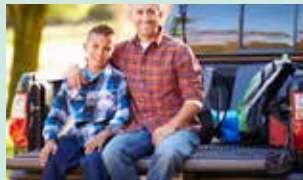
Car and Truck Loans

with BNCCU for a possible lower payment and savings! We will do everything we can to beat your current loan rate. Call us today.